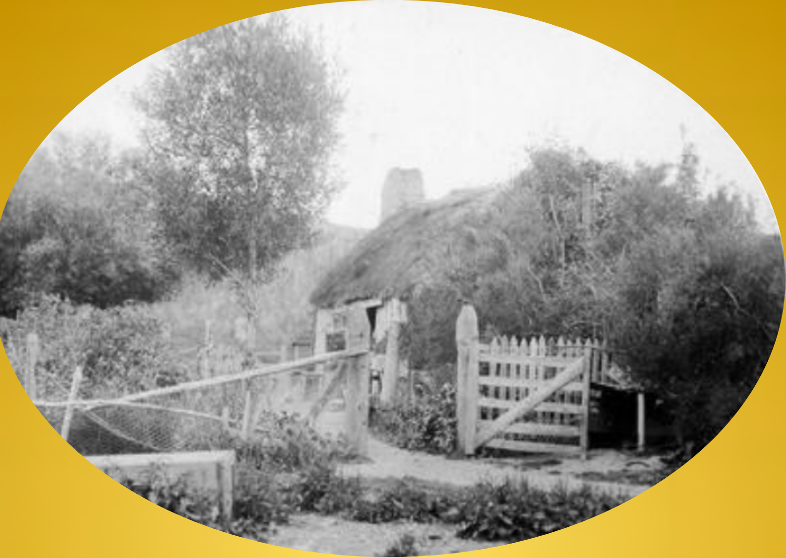
Two of the oldest houses in Hammer as of 1916