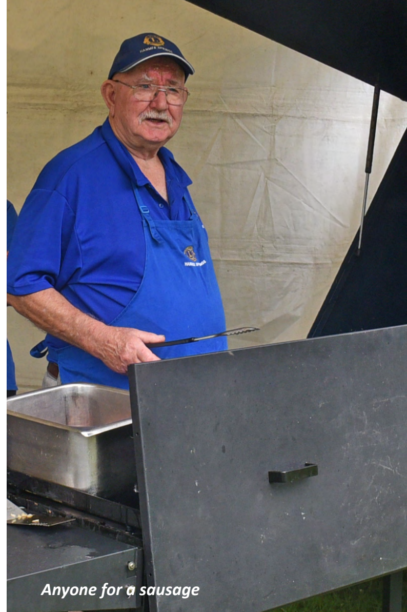
Anyone for a sausage