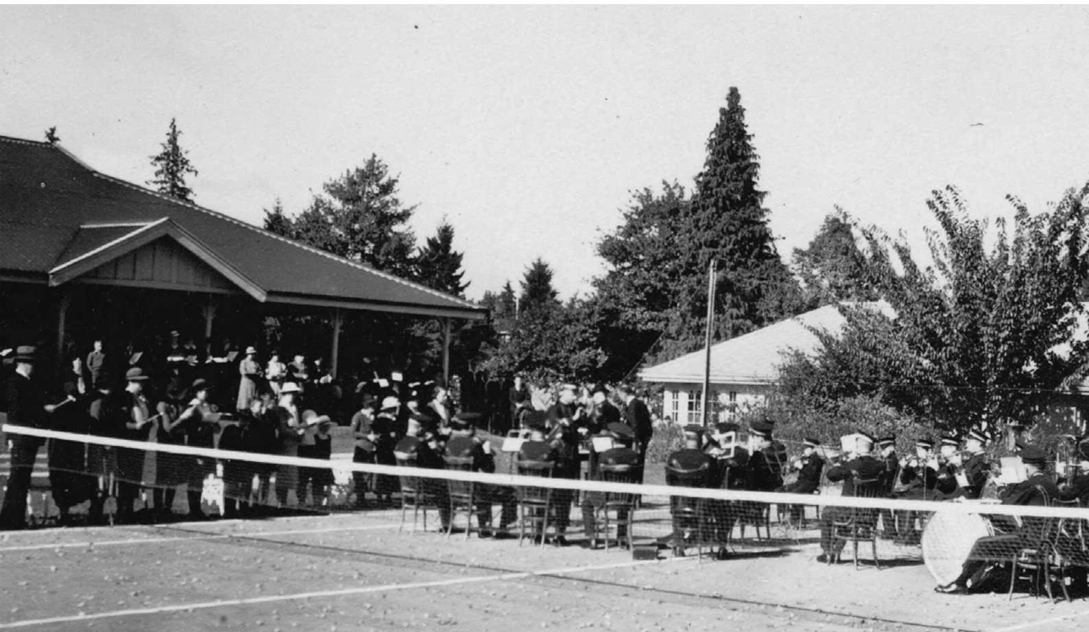
A brass band entertains on the tennis court adjacent to the Tea Kiosk

Please Note that HDC garbage & recycling bags are no longer available from the Four Square supermarket . Henceforth, bags will only be available from Hanmer Springs Service Station, the library , The Log Cabin and Super Liquor