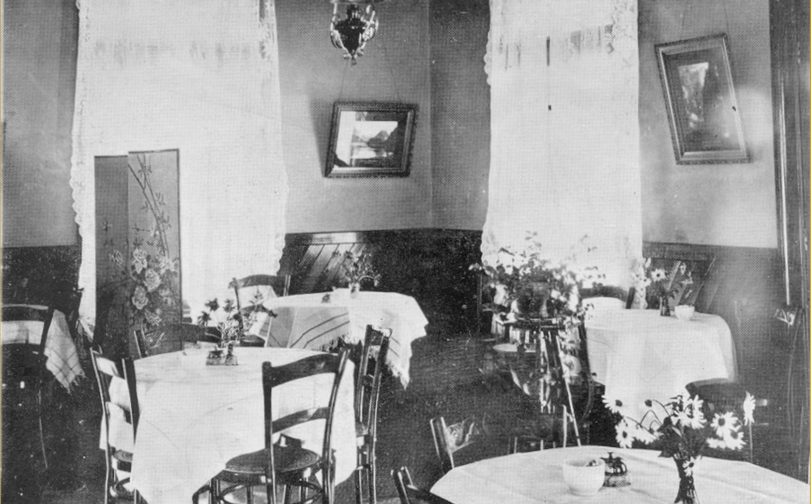
Uniformed waitresses with Lacey aprons bustled about and dispensed pots of tea and hot water and Devonshire scones with jam and cream. Sunday afternoon teas were prime time. There was also a tiered cake tray which could be brought to you. An era that ended in the fifties. Best behaviour de rigueur. Interior of the Tea Kiosk