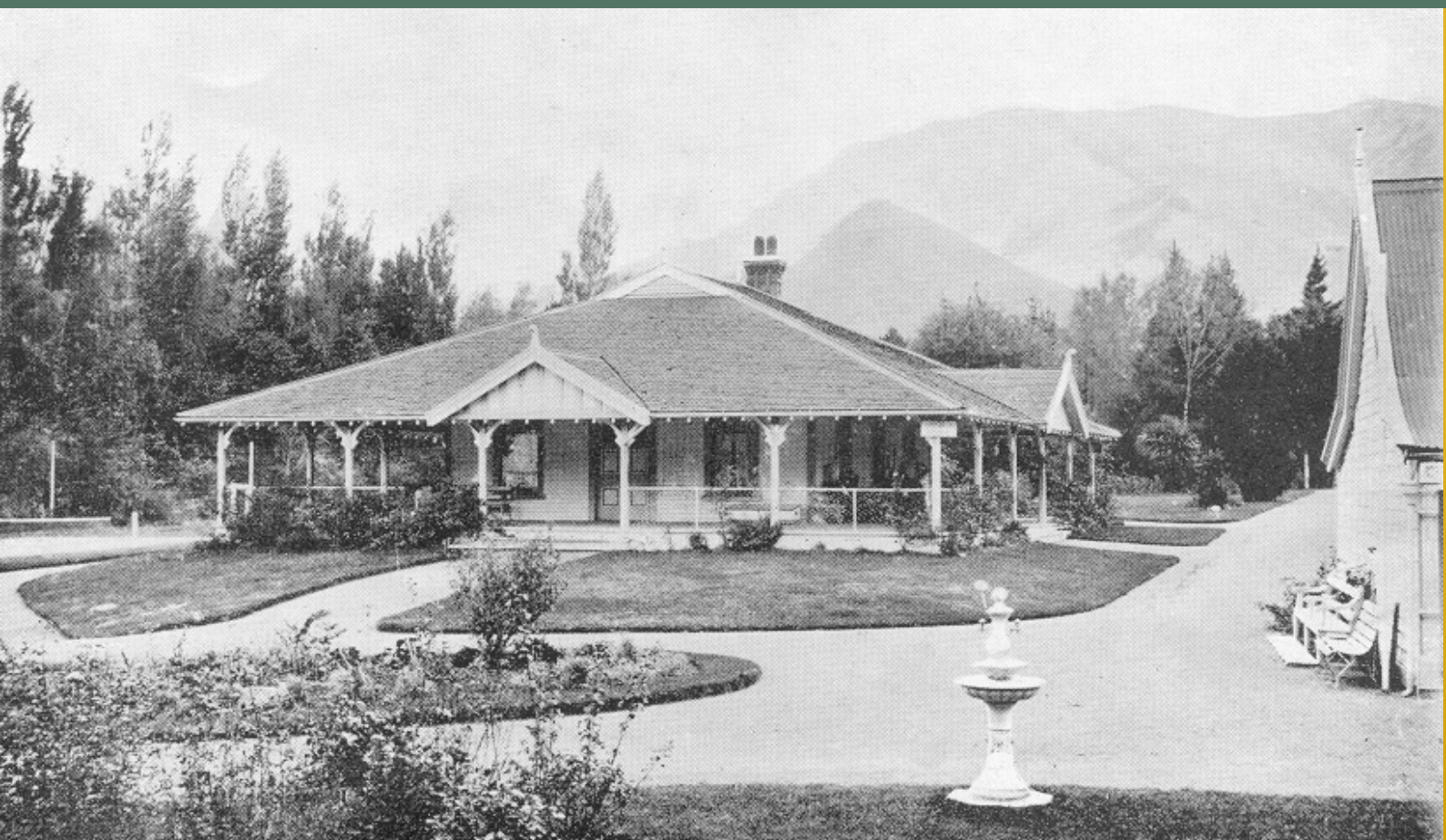
Exterior of the Tea Kiosk. The path on the right is the entrance to the gardens and the pools from Jacks Pass Road. On the left of the building was one of the several tennis courts in the complex and afternoon tea on the back verandah watching some keenly contested doubles matches was popular. Some Sundays they took away the net for bands like the Woolston Brass Band or Addington Workshop Band to entertain patients and townsfolk.