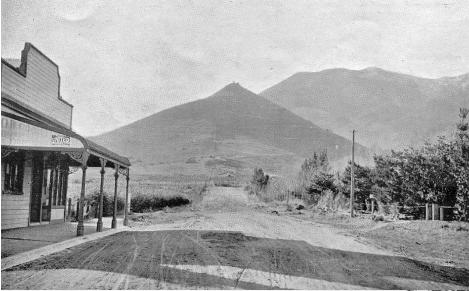
Downtown Hammer Springs around 1906