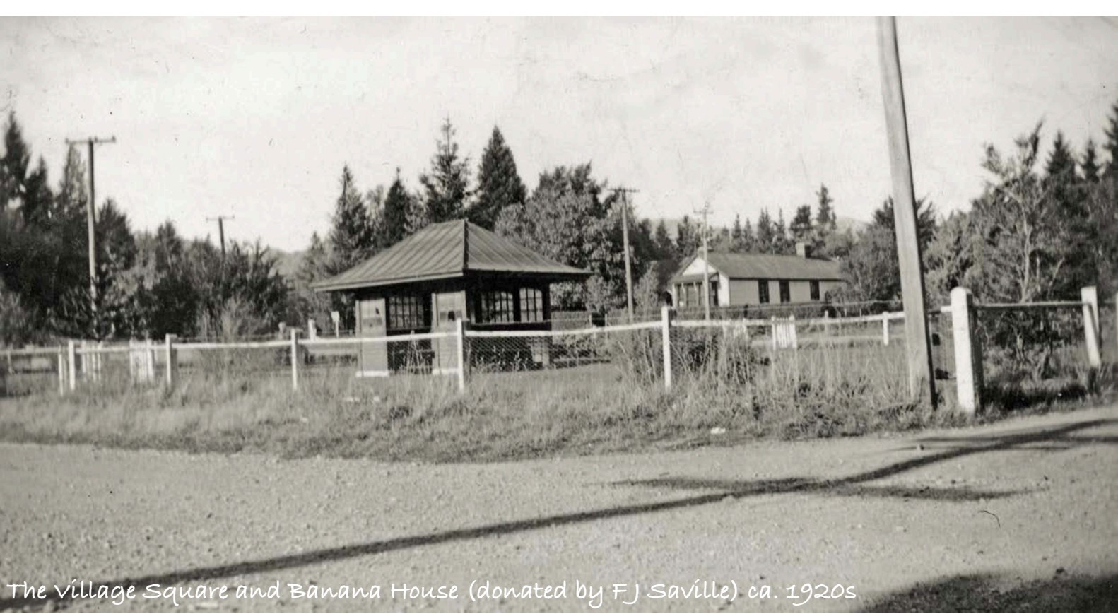
The Village Square and Banana House (donated by FJ Saville) ca. 1920s