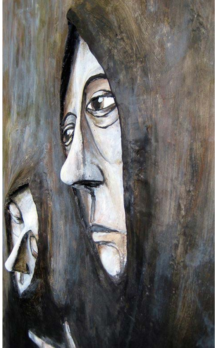
Tree Art - Above Richie M in Hanmer Forest. Right a more sinister offering from a European forest