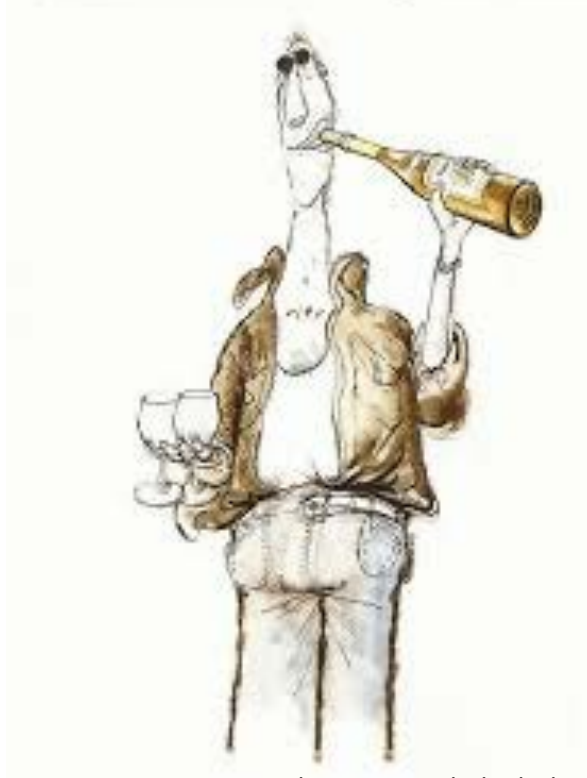
From our wine correspondent A smooth dry little number with great body