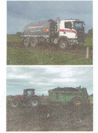
DRY MUCK SPREADERS