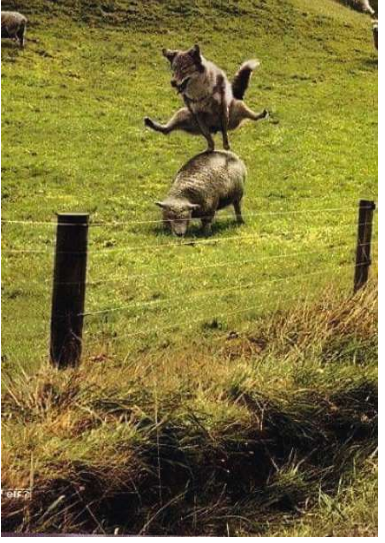
A new event introduced at the recent dog trials - the sheep dog leap frog

News is scant, but there is probably five feet of snow at Hanner. This will thaw but slowly.