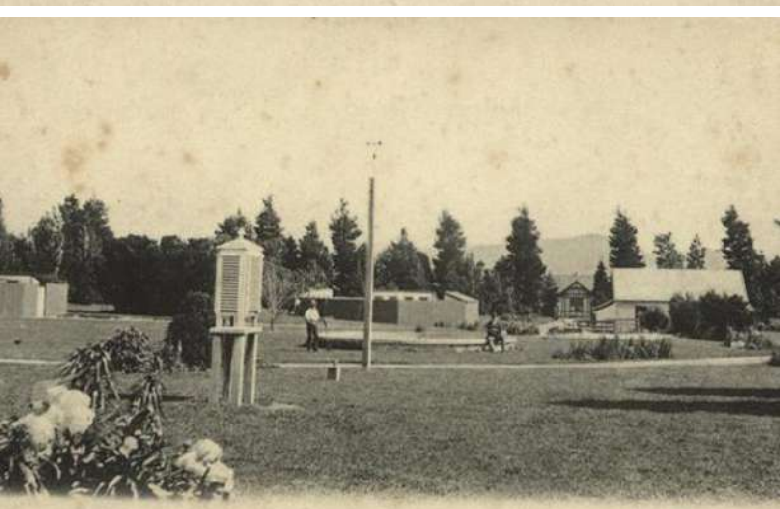
Spa Gardens, Hanmer