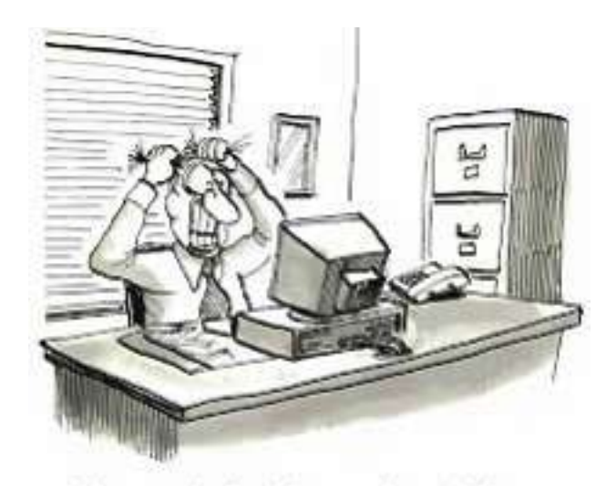
He was having his usual good time on Monday morning.

If for some reason your email reminder does not arrive you can be assured that the new Pinkie will be live on the website every Monday morning and going to <u>www.thepinkie.co.nz</u> will provide the same results whether or not our email link gets through.