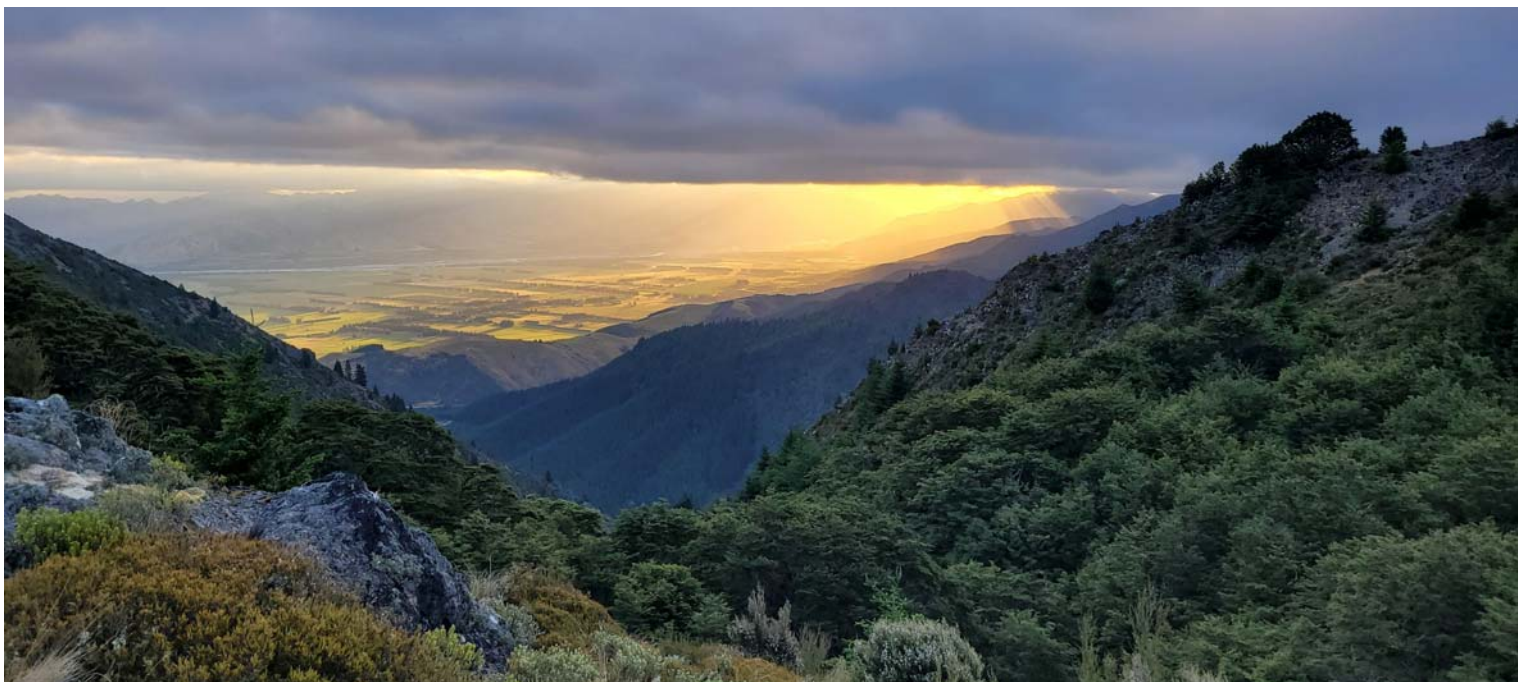
Low cloud at sunset. Looking west across the Hanmer Basin from the flanks of Mt Isobel.