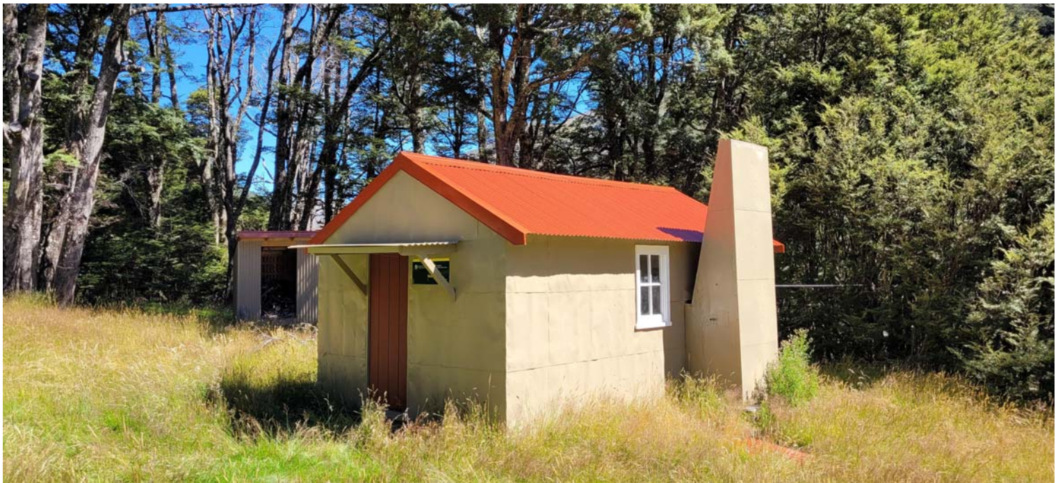
"Over the back" ... a backcountry hut.