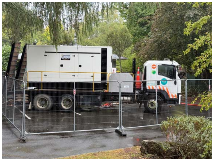
A temporary generator behind the Library