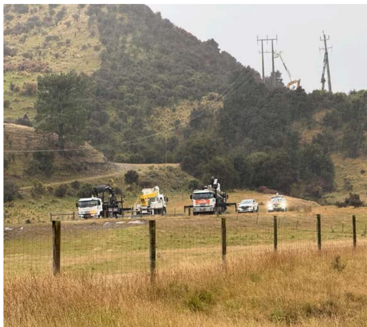
Heavy rain last week during MainPower works