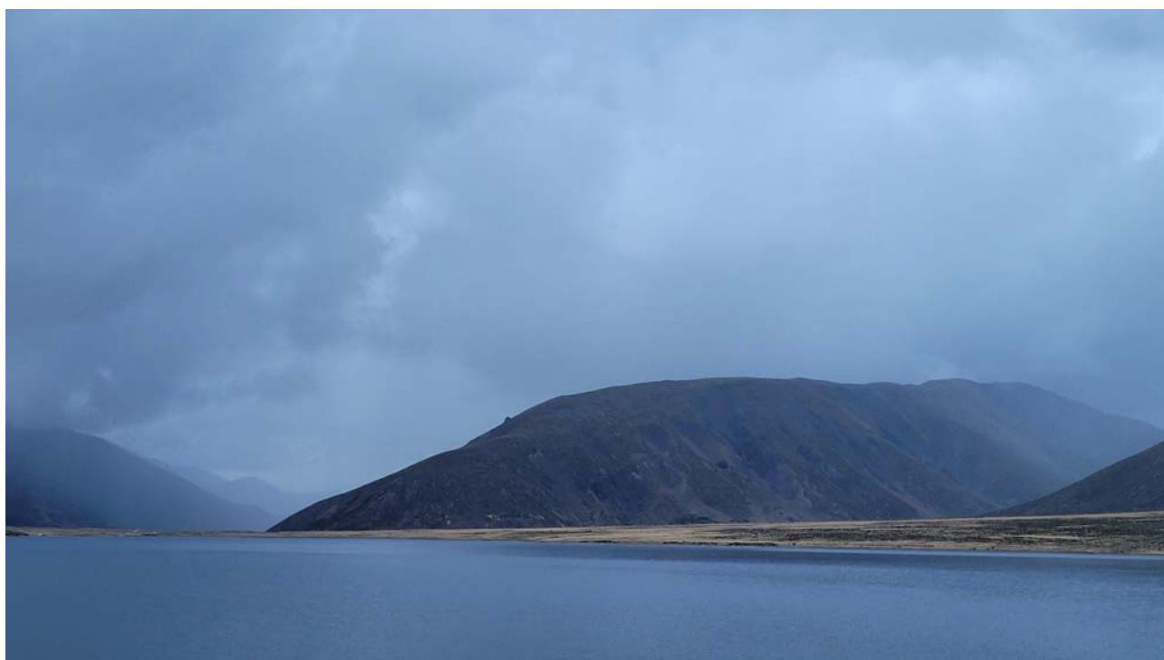
A southerly blows through Lake Tennyson